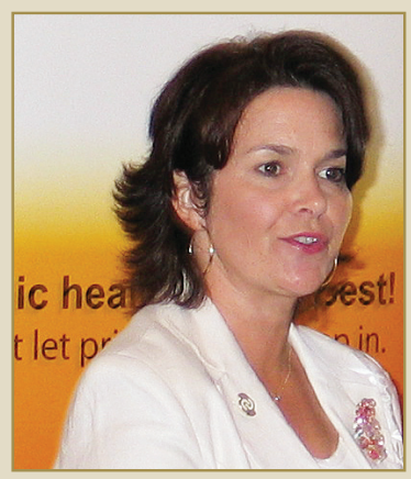
Nurses tell Premiers: stop privatization